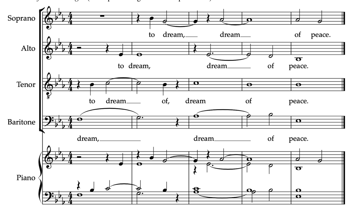
STUDENT sings example with text.

8) "You will now hear a short choral example played three times. Be sure to follow the line that matches your voice part. For the first two listenings, you may sing along without being scored. The third time, you will sing the example with piano accompaniment only for a score. Here is your starting pitch, followed by the first listening." (Example is sung with accompaniment.)